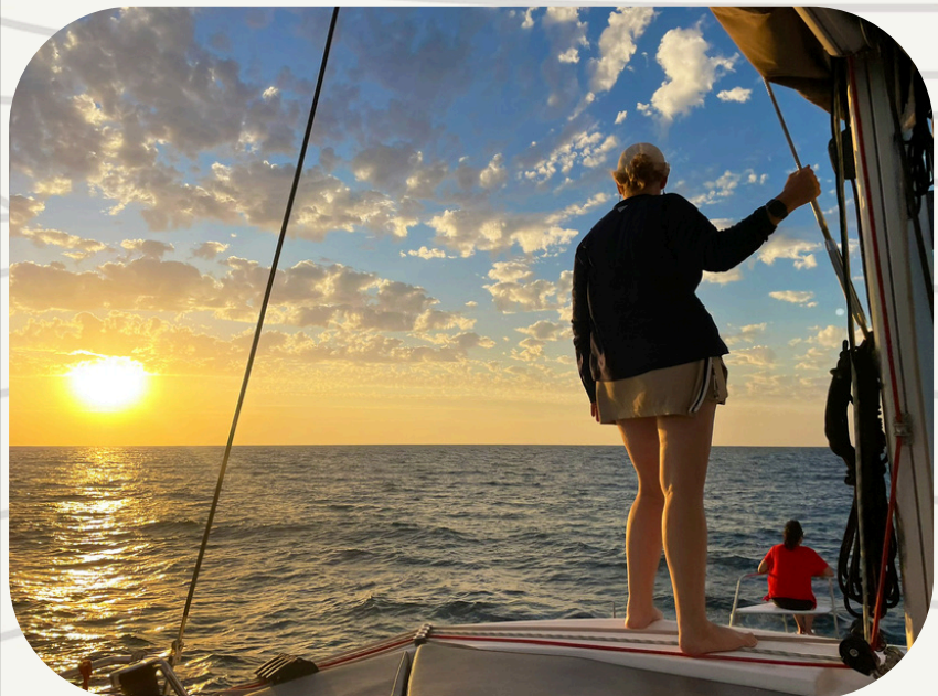
On board the catamaran s/v Redemption

This unique voyage combines the thrill of an exclusive sailing experience with hands-on outreach that delivers healthcare, education, and hope directly to underserved local villages — making a huge, tangible impact where it's needed most.